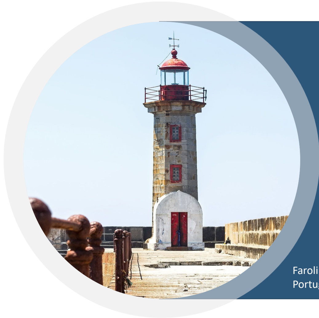
Farolim de Felgueiras Portugal