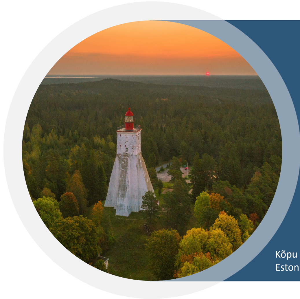
Kõpu Tuletorn Estonia