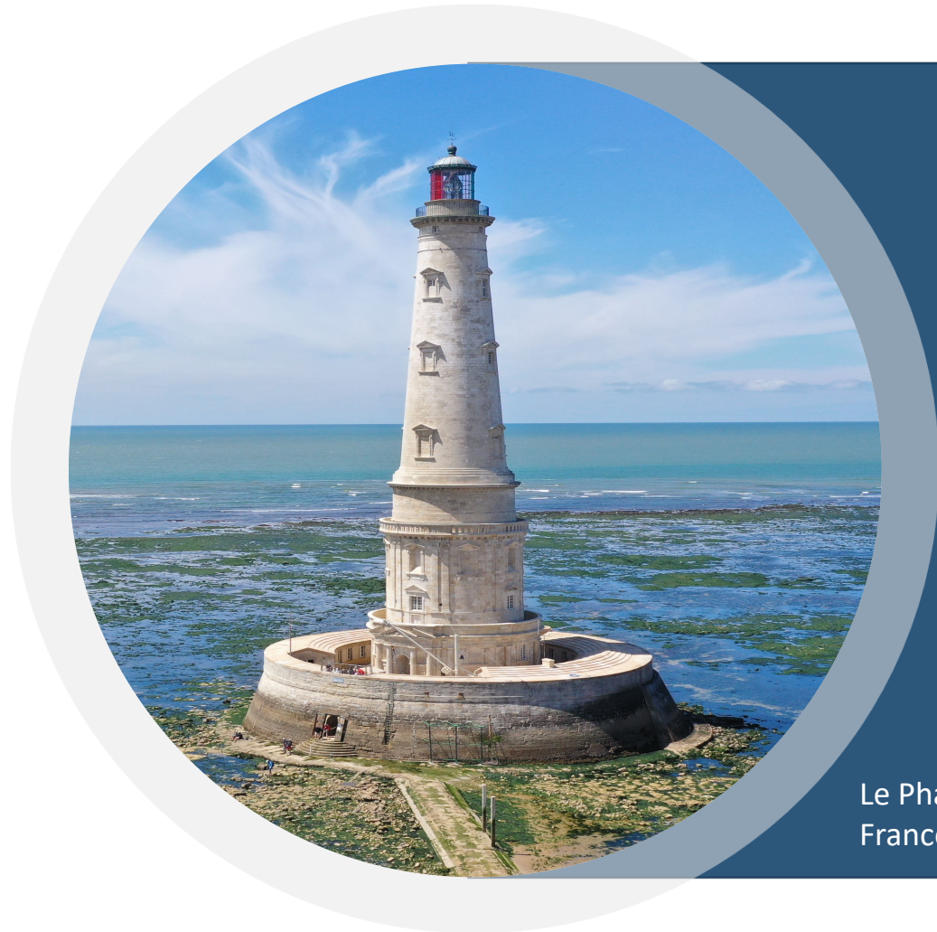
Le Phare de Cordouan France