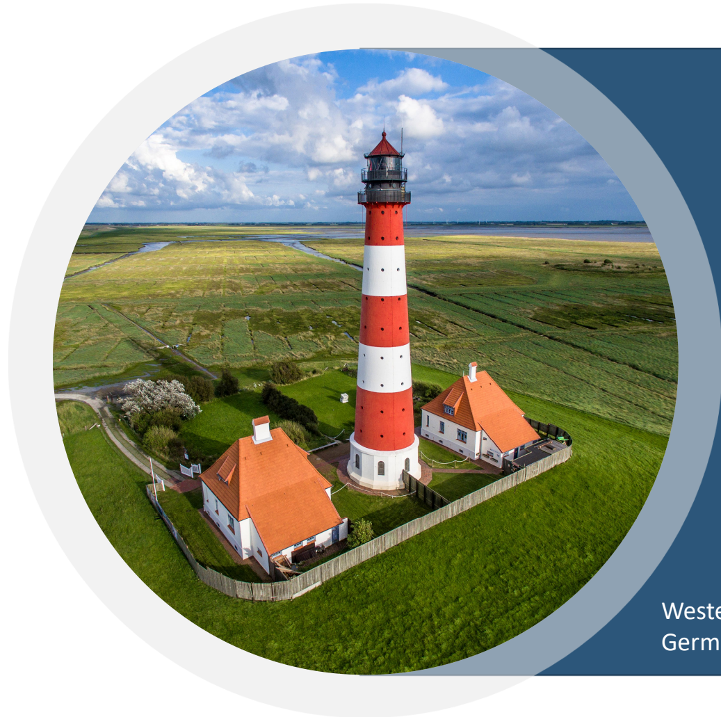
Westerhever Sand Germany