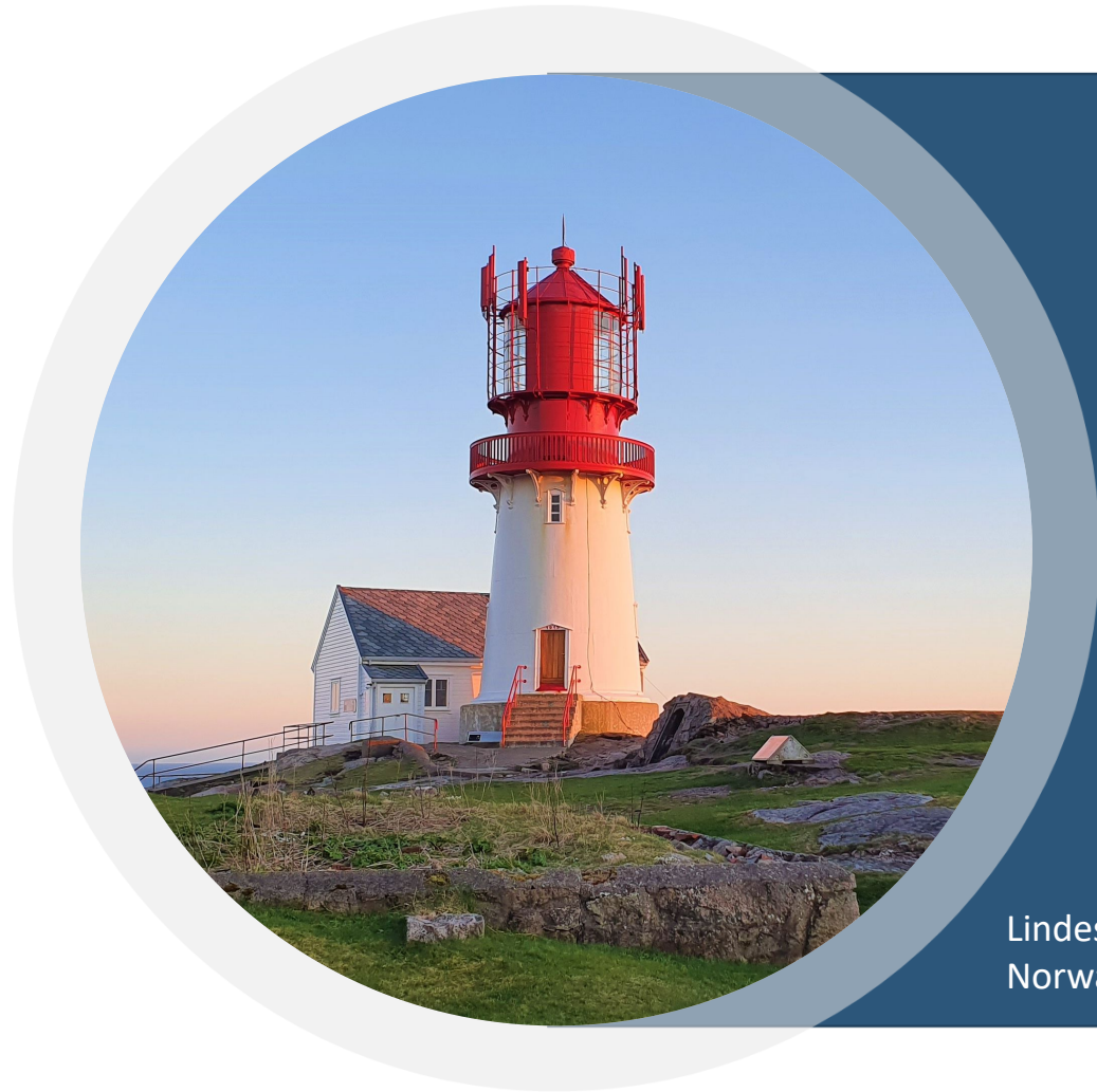
Lindesnes Fyr Norway