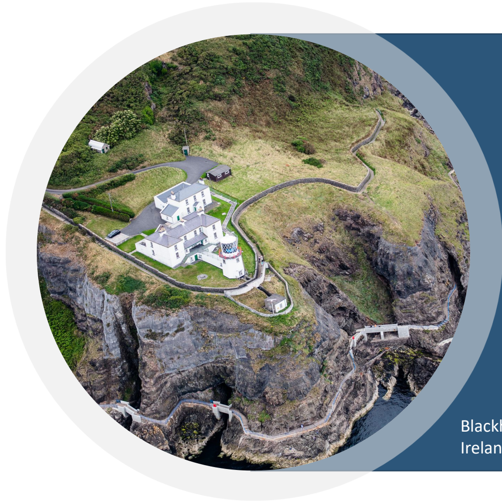
Blackhead Lighthouse Ireland